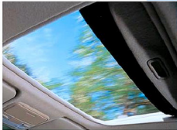
An available moonroof freshens the drive.