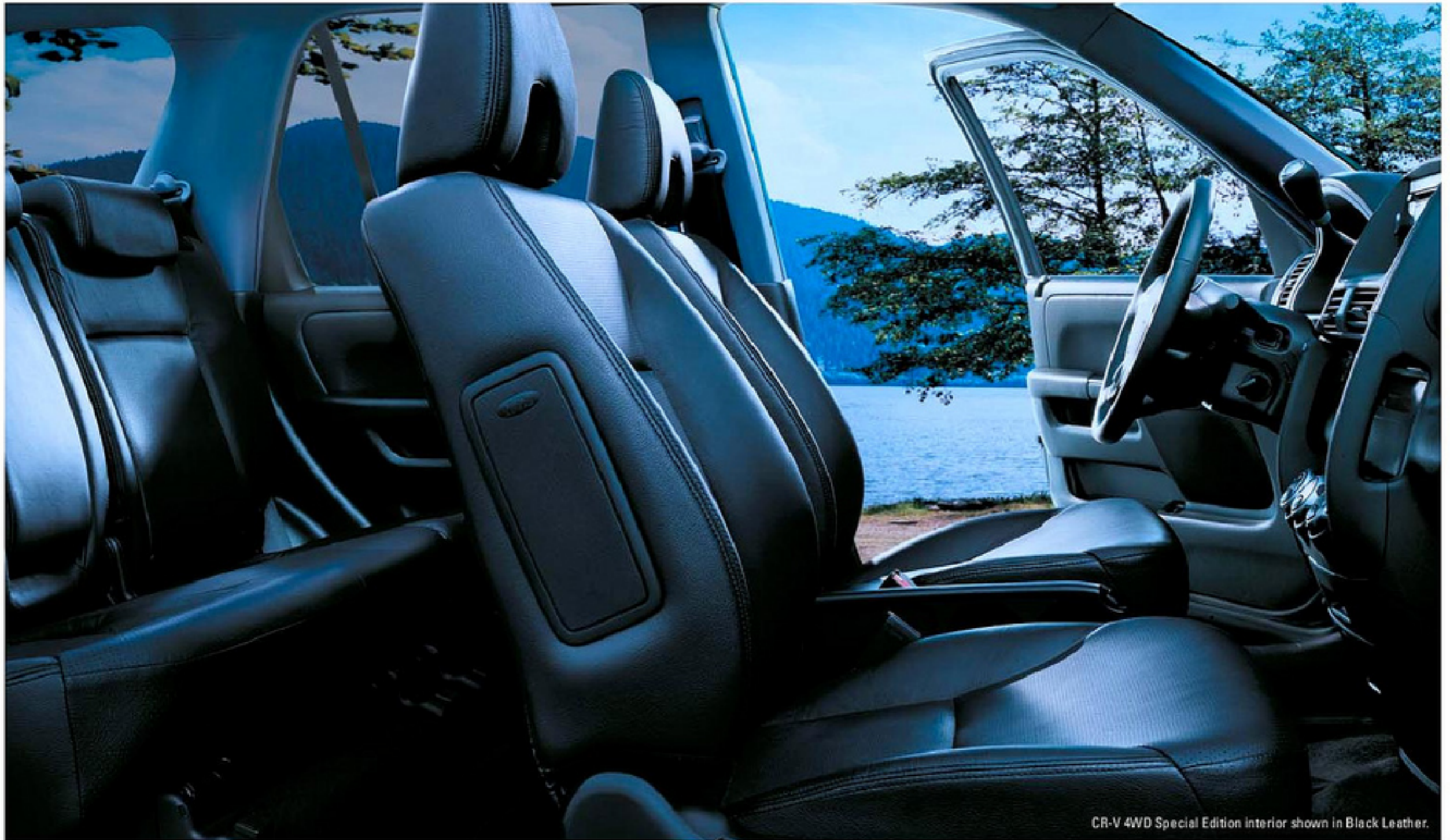
CR-V 4WD Special Edition interior shown in Black Leather.

The CR-V packs lots of luxury within its no-nonsense, capable self. You immediately appreciate its low step-in height and surprising spaciousness. Its plush seats offer a commanding view of the road. Step up to CR-V Special Edition and, along with unique exterior styling cues, you'll also enjoy its supple leather trim, a leather-wrapped steering wheel, heated front seats and heated side mirrors.