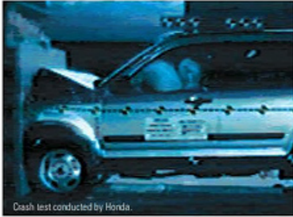
Crash test conducted by Honda.