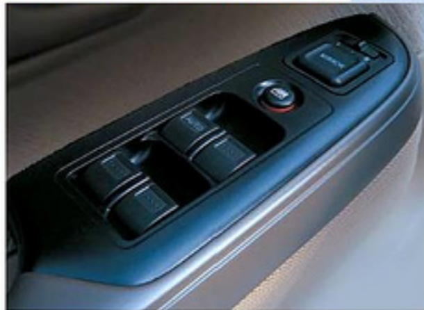
Get standard power windows and mirrors.

Load up. It's great to get all the goods.