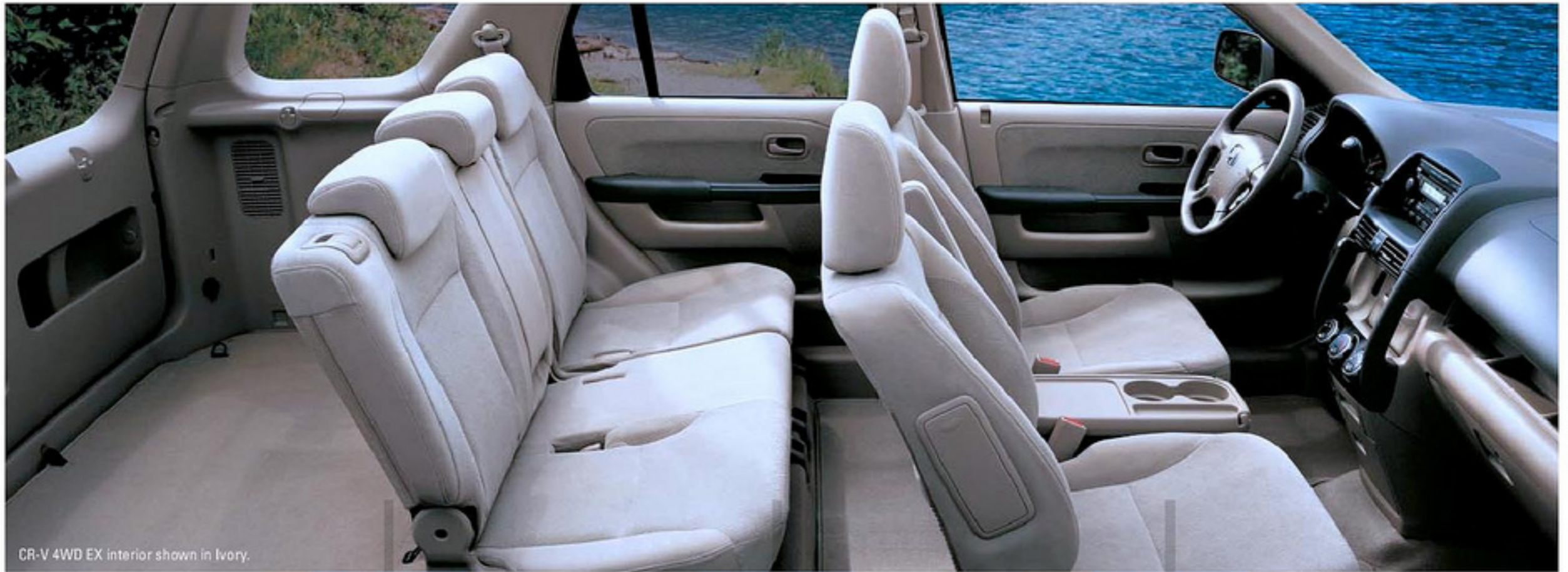
CR-V 4WD EX interior shown in Ivory.