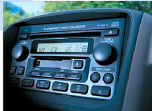
Sound solutions – from CDs to XM readiness. 1