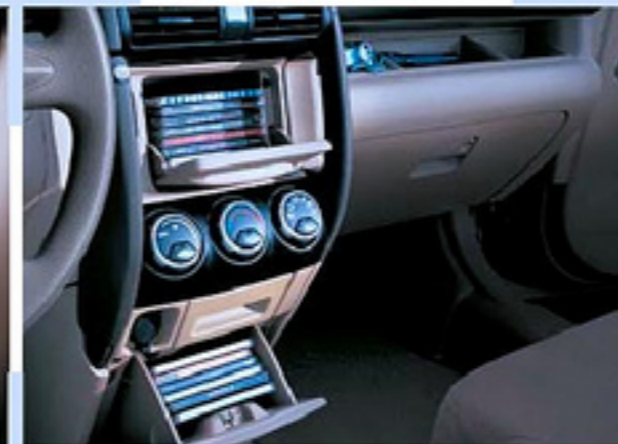
Big storage bins keep things close at hand.