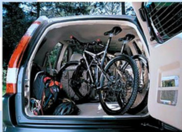
Forget the rack – just load in your bikes.*