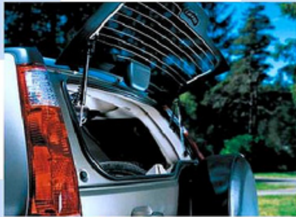
The swing-up glass hatch eases access.

Step inside and the CR-V is at the ready with a host of bins and door pockets, beverage holders for folks both in front and in the back, and even front and rear 12-volt power outlets. And there are plenty of tie-down anchors to keep things secure.