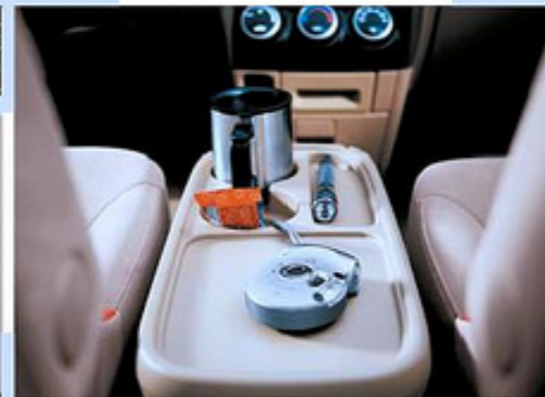
The retractable center tray can make way.