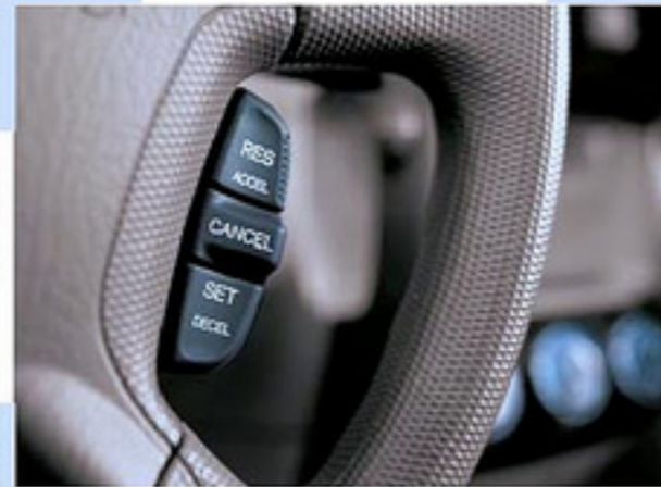
Cruise control: an easy way to thumb a ride.

Load up. It's great to get all the goods.